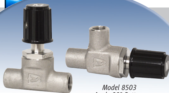
Model 8504 Straight Pattern CART III Needle Valve