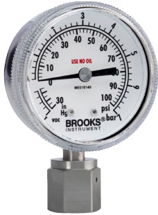
S122 Pressure Gauge